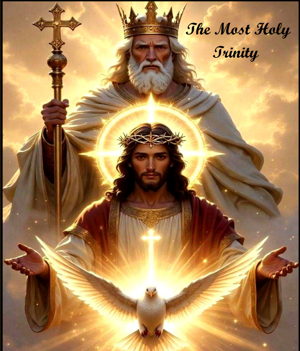
The Most Holy Trinity